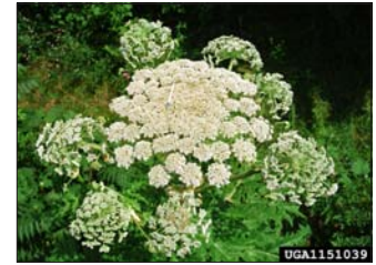
Left: Giant hogweed leaf – 3 feet long. Right: Flower.

▪ Flowers are white, clustered into a large, compound umbel with a flat bottom and gently rounded top. Umbels can be 2.5 feet wide. The plant flowers from June to August in Michigan.